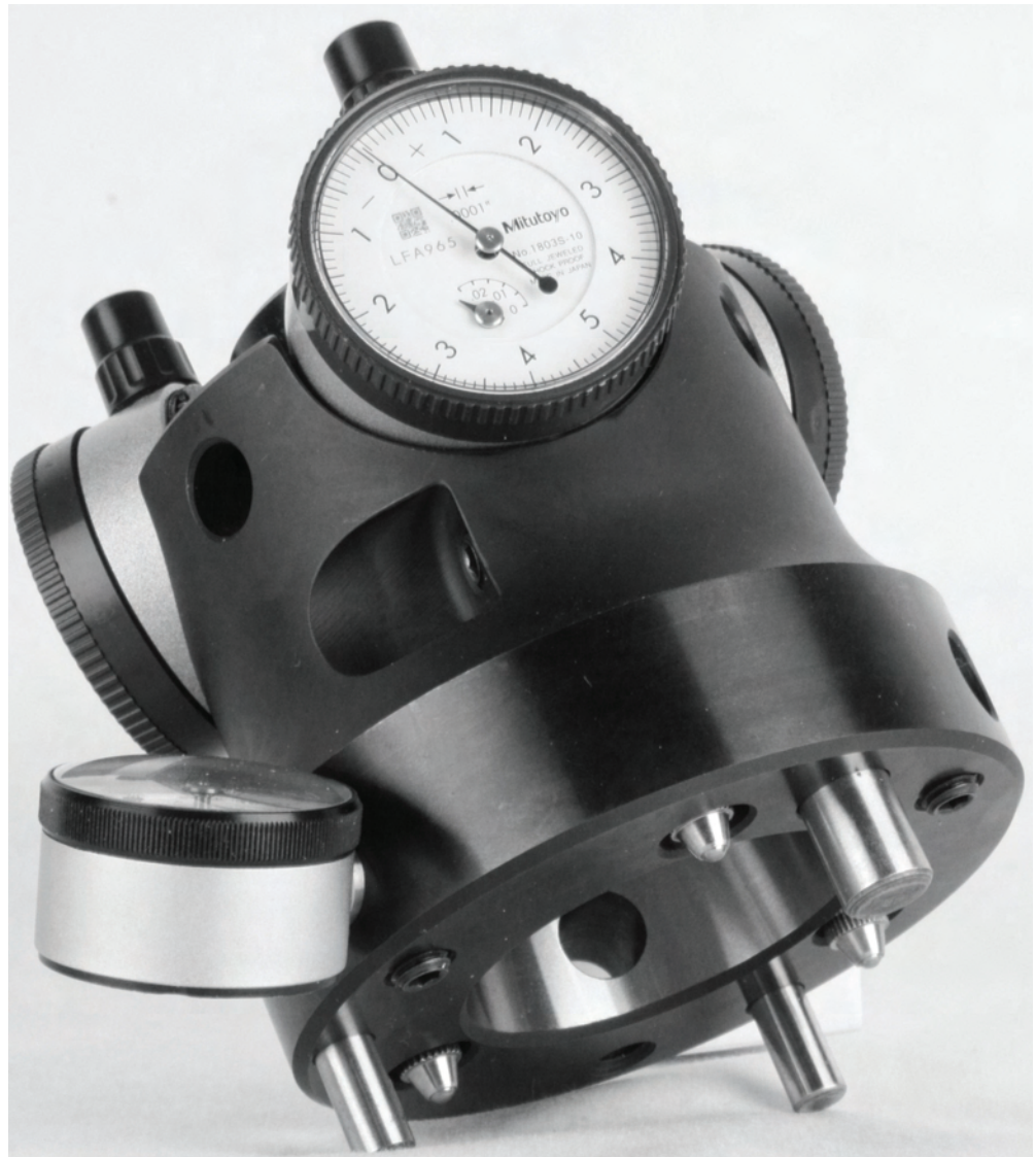
Retention knob test fixture.

Can a lowly retention knob improve high-speed machining?